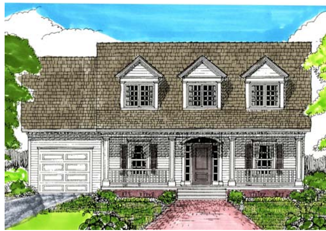
NRHA PLAN NO. (TBD) preferred 3 BR, 2 1/2 BATH 1718 S/F