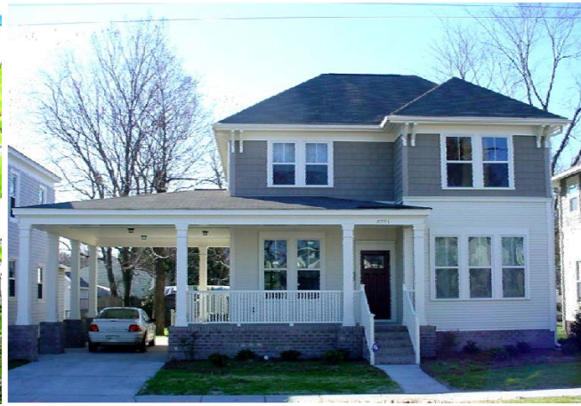
NRHA PLAN NO. LRK-08265 preferred 3 BR, 2 1/2 BATH 1815 S/F