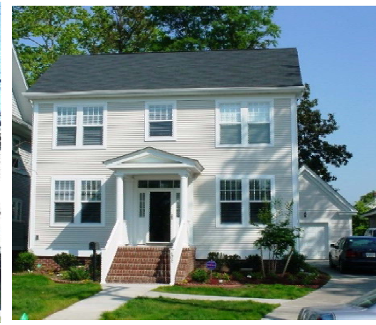
NRHA PLAN NO. E5 preferred 4 BR, 3 BATH 1600 S/F